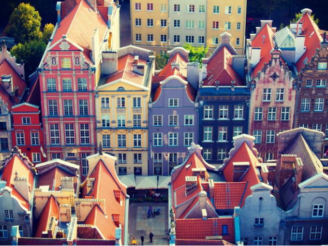
Gdansk is een van die geheime om te ontdek langs die Baltiese See!