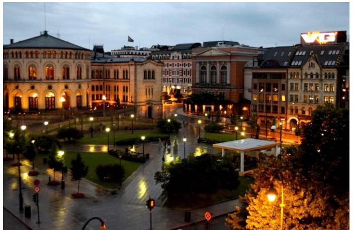
Moenie die vertonings in die Dawn se Stardust Theatre misloop nie! Ons Baltiese bootvaart eindig by Oslo in Noorweë