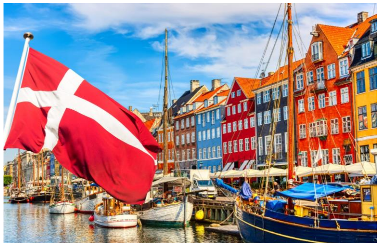
Kopenhagen se Nyhavn