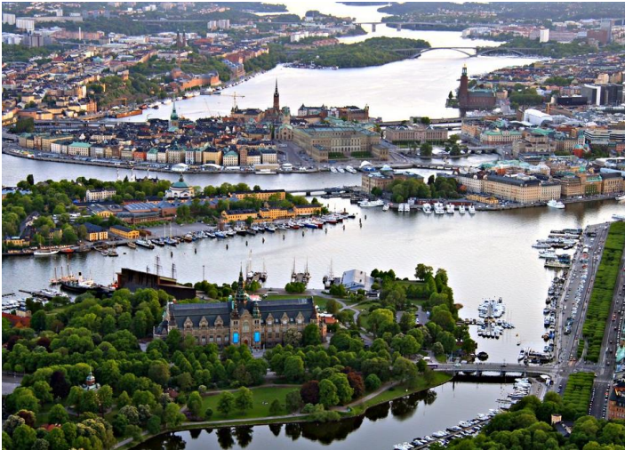
'n Skilderagtige deel van Stockholm, Swede se hoofstad

Ons bus sal reeds om 12:00 vanaf die hotel na die hawe vertrek. Nadat jy jou kajuit ontvang het, is daar kans vir 'n heerlike eerste middagete aanboord by die Garden Café Buffet!