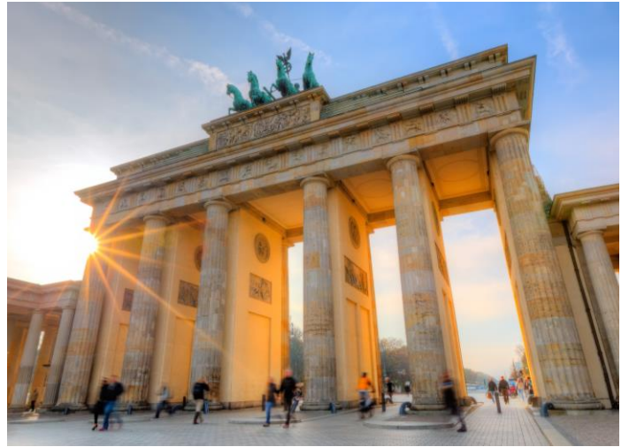
Berlyn se bekende Brandenburg Gate