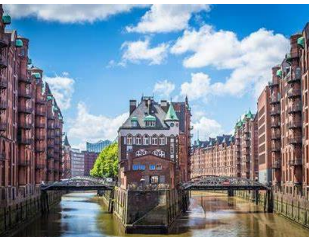
Hamburg is geleë in die Noordweste van Duitsland