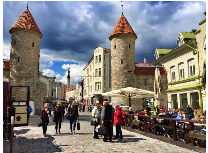
Prentjiemooi Tallinn , hoofstad van Estonia