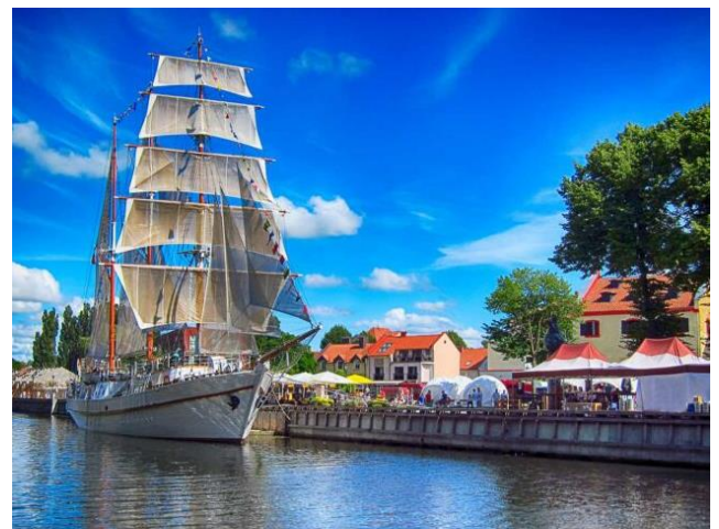
Klaipeda in Lithuanië