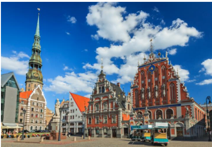
Riga se interessante argitektuur

"As the largest city in the Baltic and the capital of Latvia , Rīga offers something for everyone. From its fanciful cobblestone streets and Art Nouveau architecture to dozens of museums and a picturesque white-sand beach in nearby Jūrmala, there's much to experience in this vibrant cosmopolitan city. Come explore what has been called the "Paris of the Baltics."