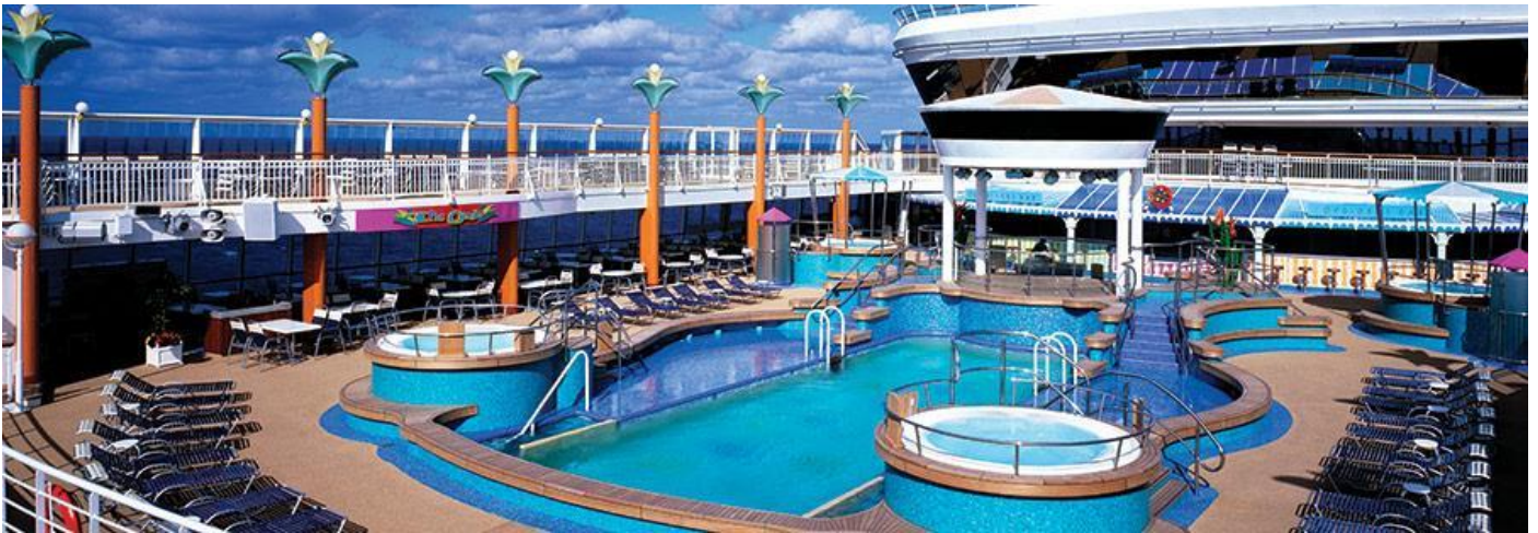
Die Norwegian Dawn se Oasis-swembaddek