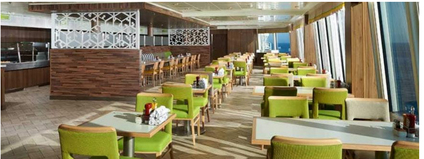
Die Garden Café Buffet Restaurant op dek 12